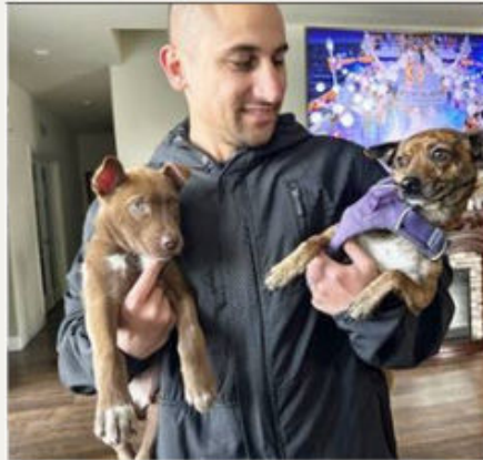
Hello from Rockwell!

Things are going great! She's very cuddly and purrs very loudly when she's petted.