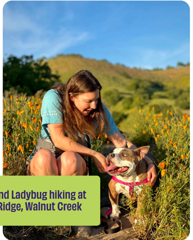
Hope and Ladybug hiking at Shell Ridge, Walnut Creek