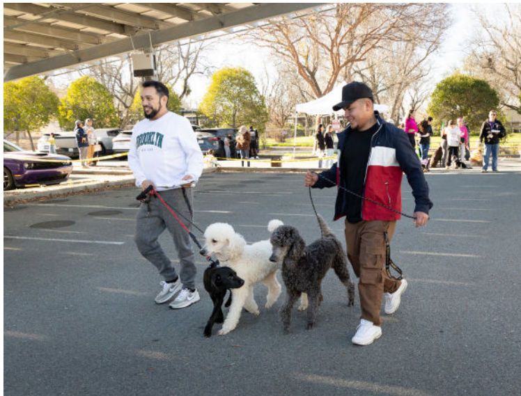
Joybound vaccine clinic participants

The first of the two grants, Measure X, is a three-year award supporting low-cost spay/neuter services in partnership with Animal Fix Clinic, to spay/neuter more than 3,000 pets over three years.