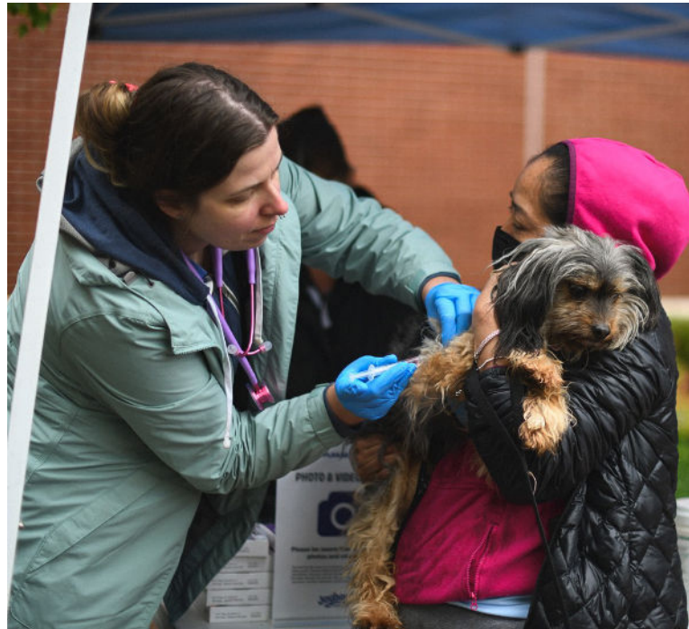
Trained Joybound volunteer vaccinates a dog during a vaccine clinic

This funding also supports free community vaccine/microchip clinics and pet retention services, allowing us to provide vaccination services for more than 3,000 pets over the next three years. Another 500 pet families will receive the funds they need to keep their pets in their homes and prevent the need to surrender their pets for financial reasons.