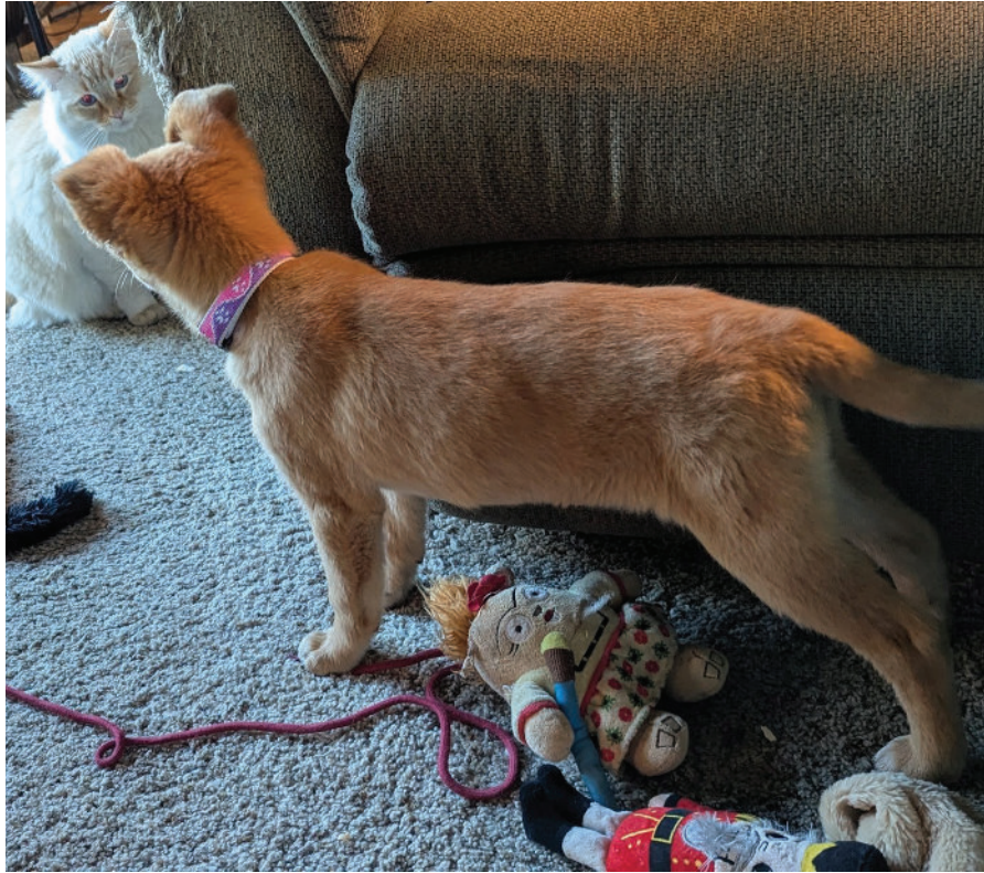
Cinder, with her new sibling, Loki, a large Flame Point Siamese

When we heard that Joybound was bringing a truckload of dogs up from the LA fires, we knew our late dog had her fine paw in this. We made the three-hour trip down to meet some of the dogs, and it was love at first sight with Belle, who we renamed Cinder."