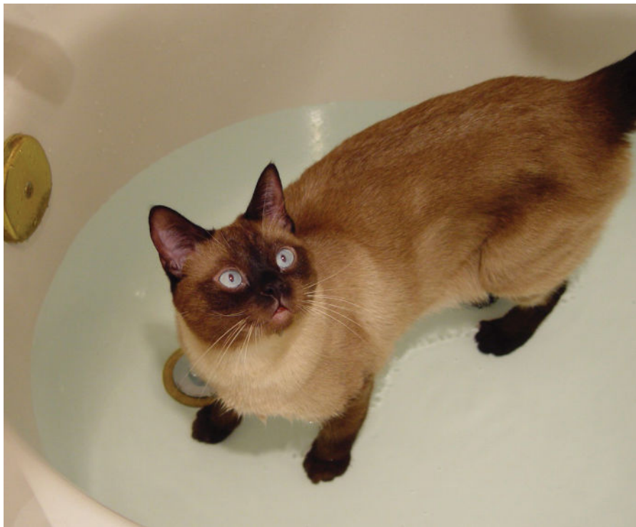
Bowie enjoying bath time

Bowie was a social butterfly, a bit of a bully to his kitten siblings, and always up for a new trick. By three months old, he was performing commands like "sit" and "shake hands." He loved bath time, fearlessly splashing around with his toy fish, and even dunking his head under the faucet. His joyful antics never failed to bring smiles.