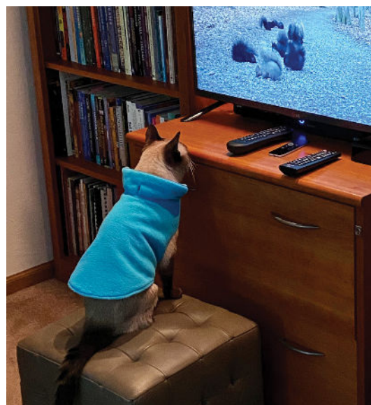
Squirrel! Bowie watching the television intensely